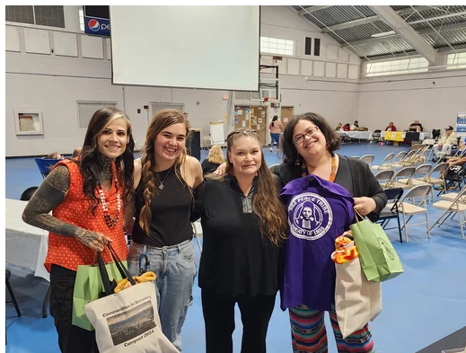
First Face Training & Research Coordinators at the Recovery Campout in Kamiah, ID.