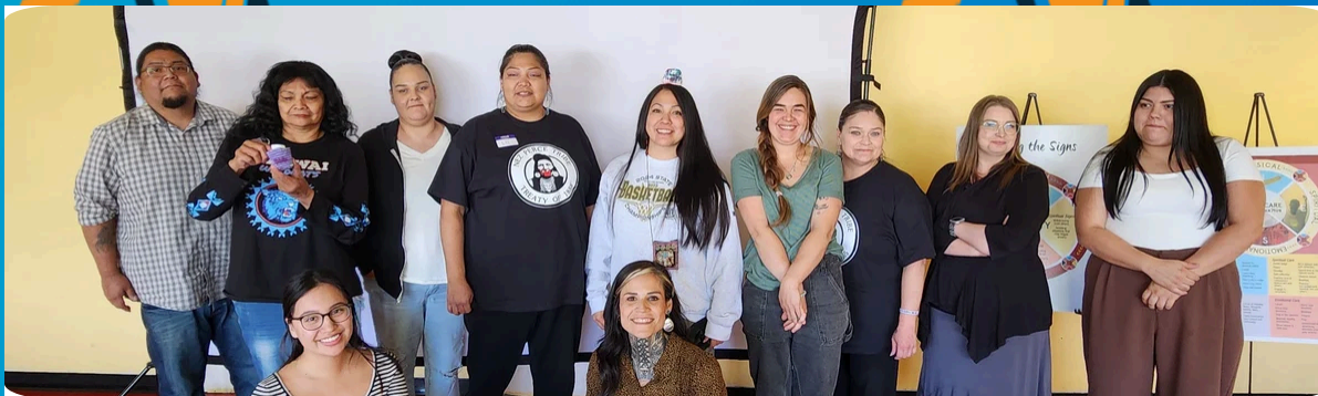
Photo: First Faces from the Kamiah training