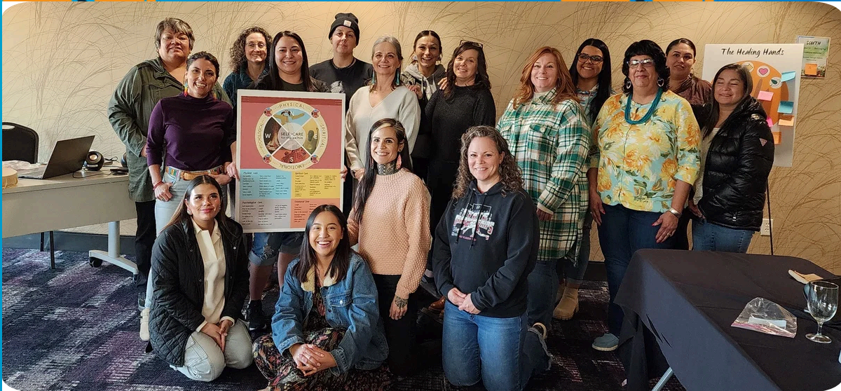
Photo: First Faces from the Omak training